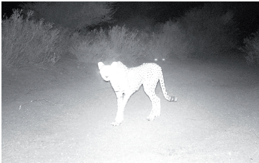
Fig. 1. Photographic evidence of cheetah in Djibouti, taken on 30 March 2022 on the Digri Plateau, Ali Sabieh Region, Djibouti, confirming the species presence in the country for the first time in 30 years (Photo HawkWatch International).

recorded by both active and passive monitoring. In 2022, cameras were deployed using only active monitoring settings, i.e., recording a burst of three consecutive photos when triggered with a 10-second delay between bursts.